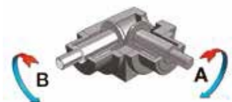
Rotazioni forma costruttiva TIPO 26 TYPE 26 constructive form revolutions