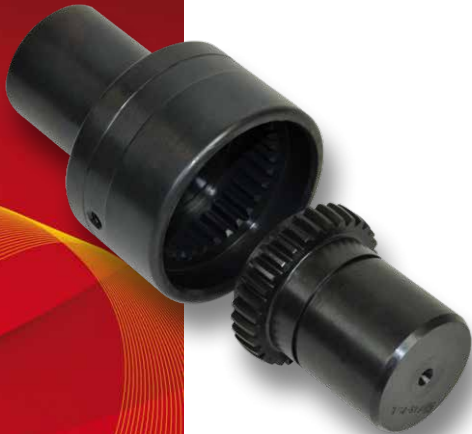
GFAS COUPLING WITH STEEL BELL